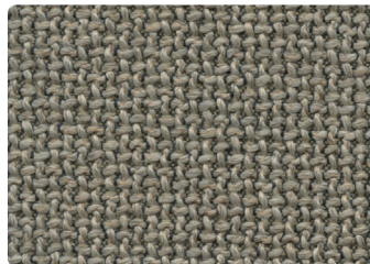
19WE Light Brown