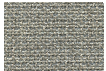
03WE Light Grey