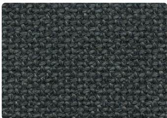
13WE Dark Grey