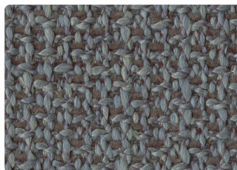
52CRO Bluish Green