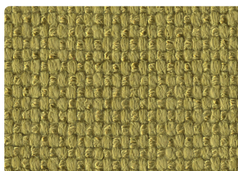
07CI Lemon Curry

Please use this sample card as indicative, only. It is provided as a guide. There may be variations between this sample card and the real samples.