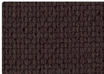
04CI Dark Brown