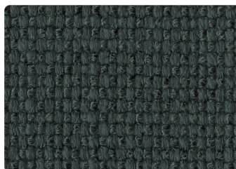
05CI Alp Green